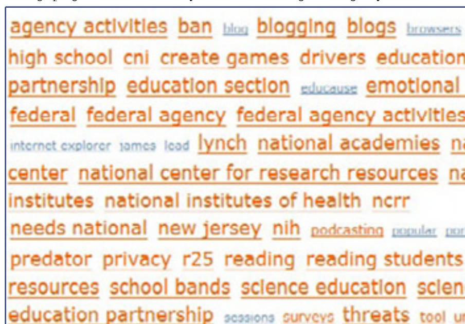
Tag Cloud of a NITLE Blog Generated by < http://tagcloud.com/ >, October 2005

Social bookmarking is one of the signature Web 2.0 categories, one that did not exist a few years ago and that is now represented by dozens of projects. The very strangeness of the term (what's social about bookmarks?) summons up much of the Web 2.0 ethos. It was launched by the advent of Joshua Schacter's del.icio.us (a cleverly spelled URL, using the rarely seen U.S. suffix)—an elegant, focused, and unassuming service for storing, describing, and sharing bookmarks. Users register and then personalize their bit of del.icio.us ( http://del.icio.us/ ) with a minimally designed page, including nothing beyond annotated